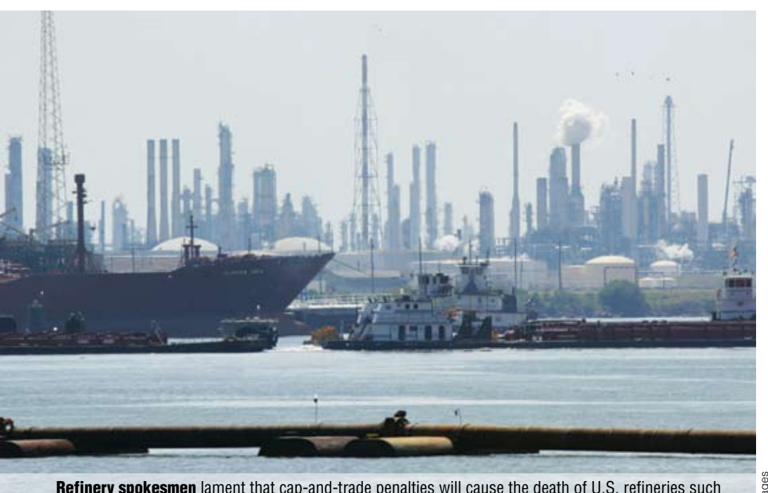
Refinery spokesmen lament that cap-and-trade penalties will cause the death of U.S. refineries such as this one in La Porte, Texas.

power are to be our energy salvation, few understand anything at all about our energy-distribution system. Solar arrays don't work very well at night, and windmills aren't of much use unless the wind is blowing at a relatively brisk rate. (Most don't develop rated output until the wind speed reaches 29 mph.) Electric consumers, however, have the expectation that even on calm nights their lights and air conditioners will work. And street lights, traffic lights, hospitals, police stations, and many commercial and industrial concerns that operate around-the-clock ought to function too. Because they generate electricity only intermittently, wind and solar installations have not replaced a single power plant and, unless an efficient way to store massive amounts of electrical energy is discovered, will not do so. The "renewable energy sources" so