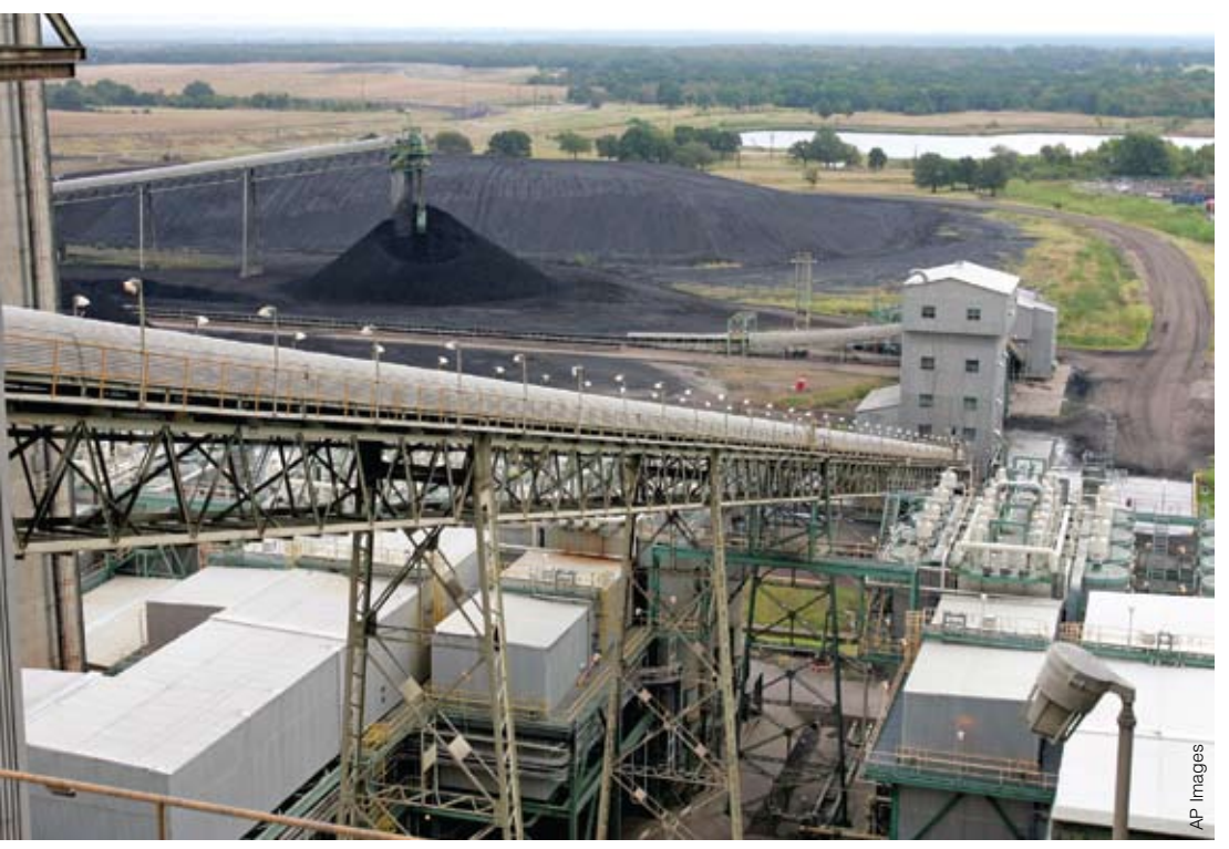
This Texas plant was to be one of 11 planned to supply power to future Texas consumers, but under pressure from Environmental Defense and the Natural Resources Defense Council, only three will be built. This decision fits well with Obama's opinion of the leading source of electrical power in the United States: "So if somebody wants to build a coal-powered plant, they can; it's just that it will bankrupt them because they're going to be charged a huge sum for all that greenhouse gas that's being emitted."

Thankfully, small sections of the bill are less obtuse. For instance, the bill actually tells us on pages 1,018 and 1,019 in almost plain English what "Cap" means in Cap and Trade: