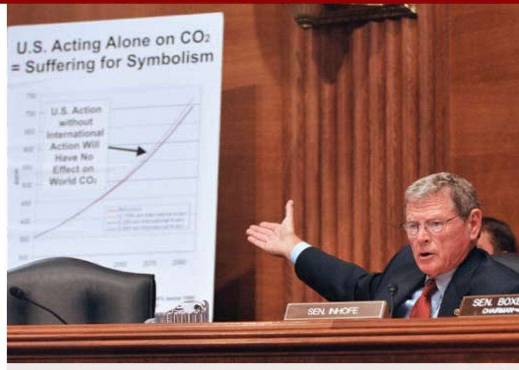
A staunch believer in re-examining the UN's IPCC committee evidence of anthropogenic global warming, Oklahoma Republican Senator Jim Inhofe intends to investigate the EPA coverup of evidence showing carbon dioxide is not the cause of a natural planetary warming trend.

Whatever the totality of the danger of this legislation, its potential for harm has been picked up by some groups — notably the